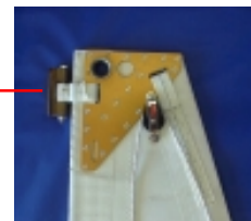
Super strong double aluminum headboards featuring hand sewn metal slides (if n

Copyright Neil Pryde Sails Int. 2002 17-OCT-01