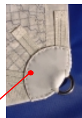
Stainless external rings leathered to protect from chafe and U.V.