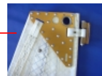
Super strong double aluminum headboards featuring hand sewn metal slide(s) when applicable.