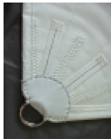
Strapped-in rings for ultimate durability.