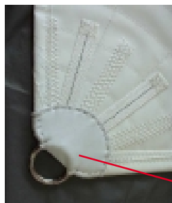
External stainless ring covered with handsewn leather.