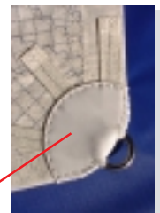
External corner rings finished with leather and 'capped' webbing straps.